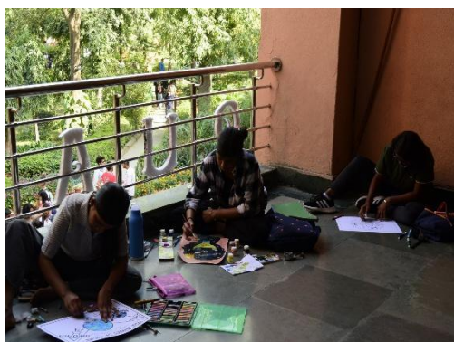
Fig 7:- Glimpse of Poster making competition