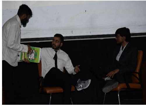
Fig 4:- "Missile Man" Play

A play "Missile Man" providing an insight into the life of Dr. APJ Abdul Kalam was followed by the seminar. The play portrayed the struggles and hard work of Dr. APJ Abdul Kalam, his strong will to learn and always move forward in life, his determination to achieve his goals and deeply inspired the audience into never giving up and fighting against all odds. The play was enacted by the students of BSc physics Hons.