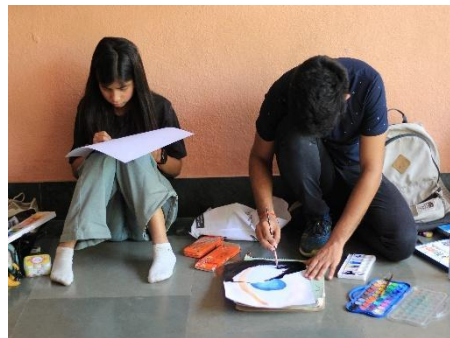
Fig 6:- Poster making competition

Next up we had the quiz competition, Quizenia a physics quiz organised in the auditorium for students from different colleges, providing a great opportunity for the physics enthusiasts to challenge their trivia and win cash prizes. Alongside the quiz, we had the poster making competition held at the Hawa Mahal of Shivaji college, Kalakriti. Students from different colleges participated and visualised their creative ideas and talents.