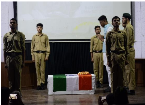
Fig 5:- Tributes are being paid to our Missile Man

A play "Missile Man" providing an insight into the life of Dr. APJ Abdul Kalam was followed by the seminar. The play portrayed the struggles and hard work of Dr. APJ Abdul Kalam, his strong will to learn and always move forward in life, his determination to achieve his goals and deeply inspired the audience into never giving up and fighting against all odds. The play was enacted by the students of BSc physics Hons.