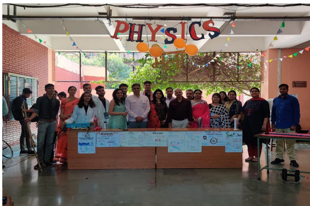
Fig 9:- Group Photograph during Physics Mela

The hard work, creativity and efforts of students and teachers together brought about a successful, fun and knowledgeable event. The fest turned out to be a great day for students, teachers and the participants.