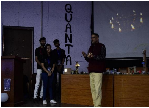
Fig 3:- Glimpse of seminar